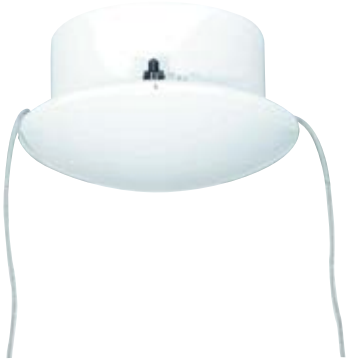
Shown approx. 15% actual size.