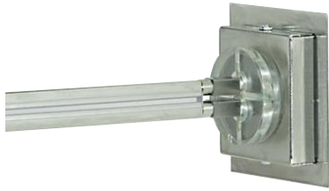
Shown approx. 45% actual size.