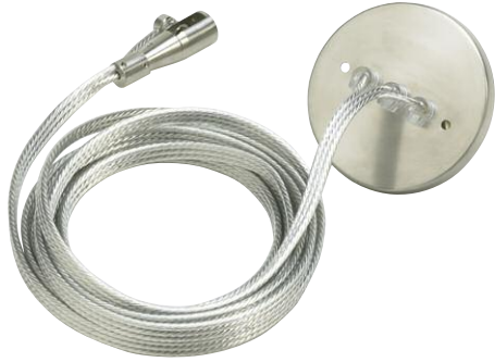
Shown approx. 20% actual size.