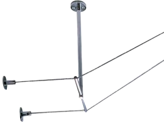
Shown approx. 10% actual size.