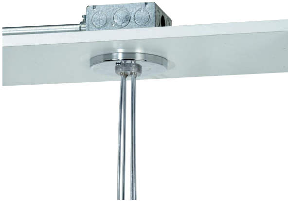
Shown approx. 20% actual size.