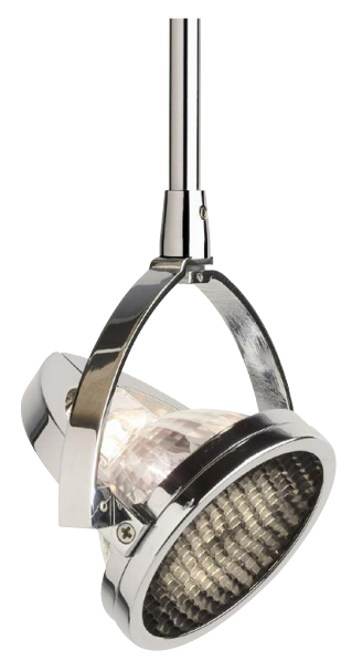
JOHN Shown approximately 60% actual size.