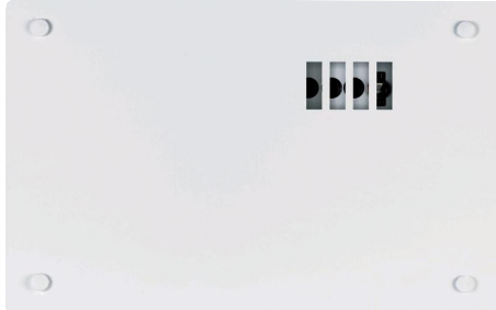
Shown approximately 15% actual size.