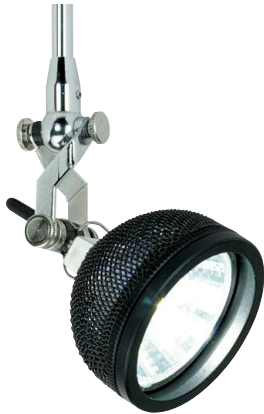
SWIVEL WITH MESH BACKLIGHT SHIELD ACCESSORY