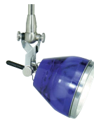
SWIVEL WITH ROUND GLASS SHIELD ACCESSORY