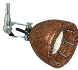
SWIVEL WITH LIL EGYPT ACCESSORY