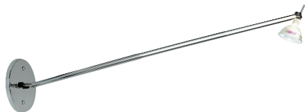
Shown approx. 10% actual size. (with 4" Round Canopy)