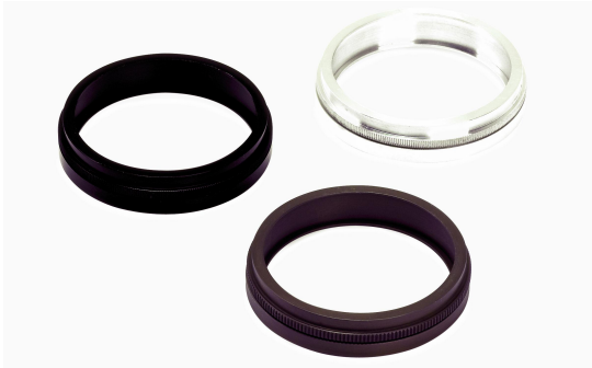
Shown approx. 35% actual size.