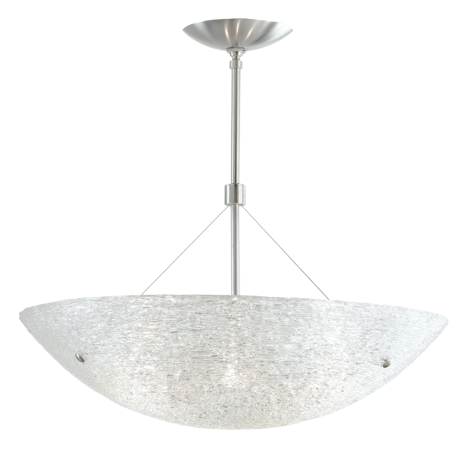
Shown approximately 10% actual size.