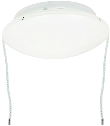
Shown approx. 20% actual size.