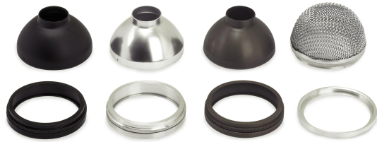
Shown approx. 20% actual size.