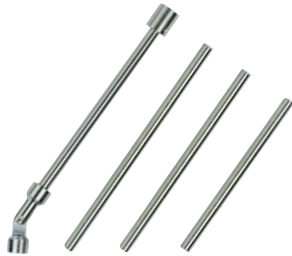
Shown approx. 15% actual size.