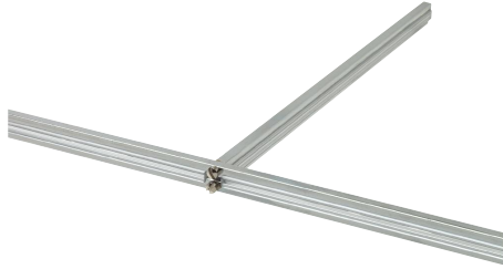
Shown approx. 10% actual size.