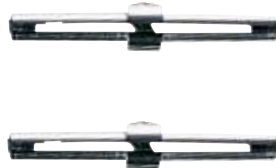
Shown approx. 120% actual size.