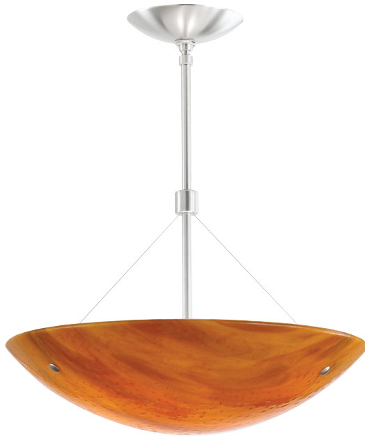
BEACH AMBER Shown approximately 10% actual size.