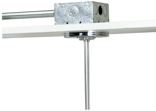
Shown approx. 20% actual size.