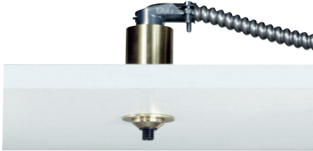
Shown approx. 25% actual size.