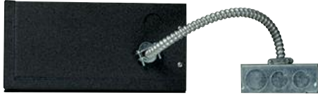
Shown approximately 10% actual size.