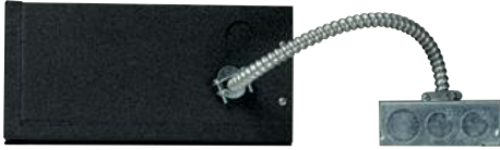
Shown approximately 10% actual size.