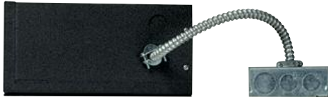
Shown approximately 10% actual size.