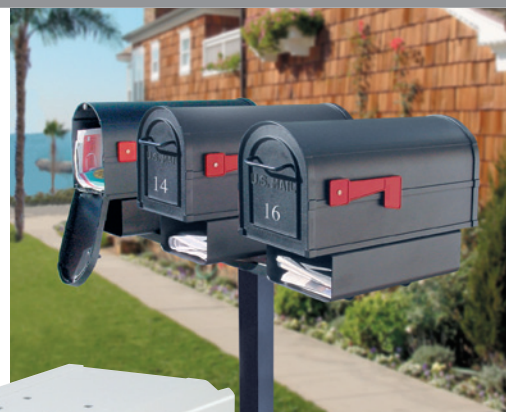
(3) #4850's and (3) #4815's on (3) wide spreader (#4883) mounted on a standard post (#4895 - see page 76) with custom numbers / letters (see page 101) displayed