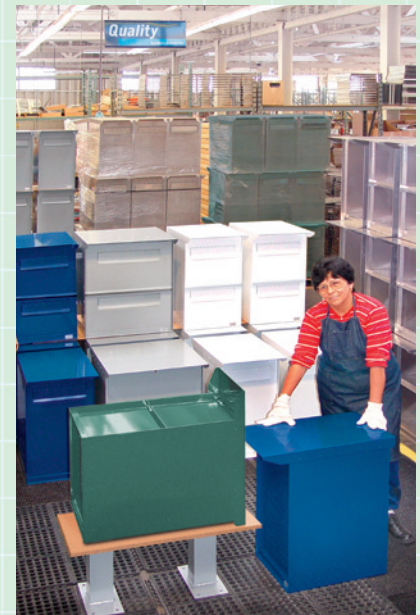
Final inspection of pedestal drop boxes