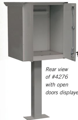
Rear view of #4276 with open doors displayed

Made entirely of aluminum, Salsbury 4200 series pedestal drop boxes are available in three (3) different sizes. Model #4275 is 15-3/4" wide, model #4276 is 23" wide and model #4277 is 30-1/4" wide. All pedestal drop boxes include a 28-1/2" high matching pedestal and are the same height (55-1/2") and depth (19"). Standard units are accessed from the rear through a two (2) point latching master door on the #4275 and two (2) master doors on the #4276 and #4277. Each door swings open over 90 degrees for unloading convenience. Standard units include a locking "T" handle (#4290) on the rear door(s), a weather protection hood and a mail flap on the front of the unit. The pedestal drop boxes feature a durable powder coated finish available in three (3) contemporary colors (or primer). Custom options (#4280 - see page 55) and custom colors (#4205) are available upon request.