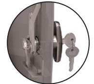
Replacement T-handle lock (with (2) keys) (#4290 - $40.00)