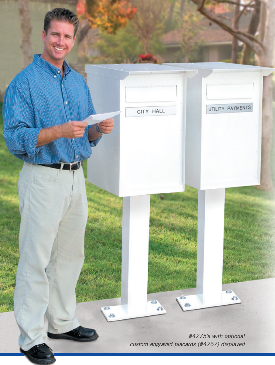
#4275's with optional custom engraved placards (#4267) displayed