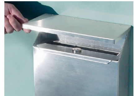
#4520 with optional security kit (#4521) displayed