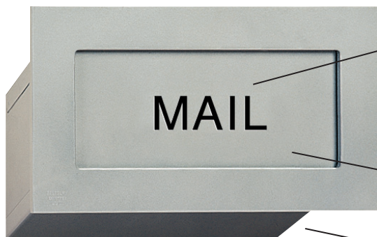
#2255 with optional custom engraving - black filled (#2266) displayed

Constructed of 1/4" thick aluminum plate and 20 gauge steel, Salsbury recessed mounted mail drops feature a spring-loaded mail flap and an adjustable mail flap stop. Mail drops also feature a durable powder coated finish available in five (5) contemporary colors. Custom engraving (#2266) is available as an option upon request. An optional receptacle (#2256 - see page 49 - order separately) aligns with the mail drop chute for receipt of deliveries. Mail drops are ideal for collecting documents and small packages and may be used for U.S.P.S. residential door mail delivery.