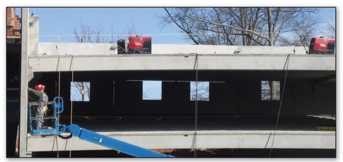
A Ranger® 225 is an excellent choice for a wide variety of projects.