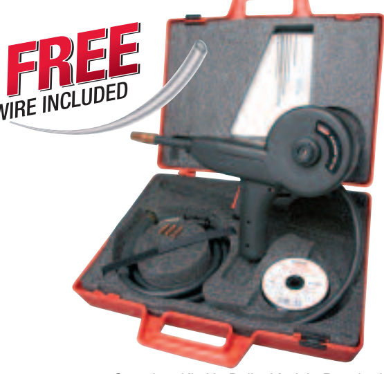
Complete Kit. No Bulky Module Required. Order K2532-1