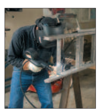
Great For Projects or Repair

Our low-priced spool gun is your most reliable aluminum feeding solution.