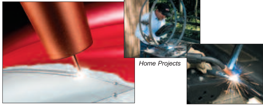
Thin Sheet Metal Autobody Work