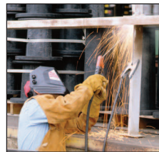
DC stick welding