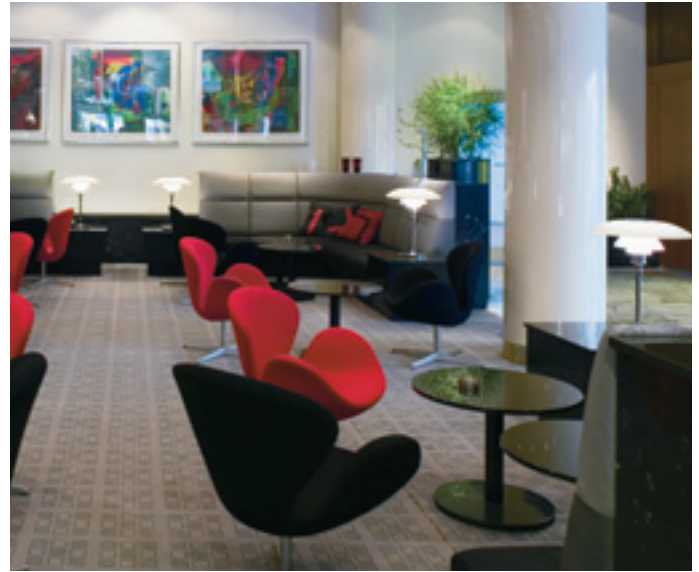
SAS Radison Royal. Copenhagen, Denmark.