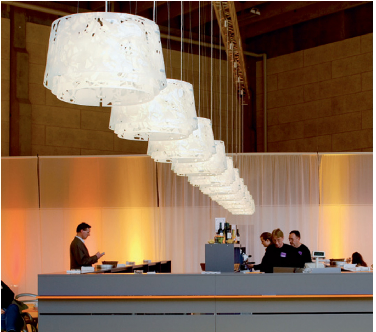
Bar Bella Center Copenhagen Furniture Fair Copenhagen, Denmark