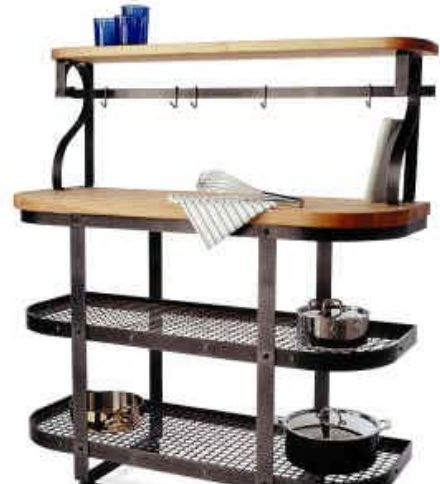
Photo: BSB1 - BSBB1 base only does not include upper shelf

See reverse side for ASSEMBLY AND INSTALLATION INSTRUCTIONS