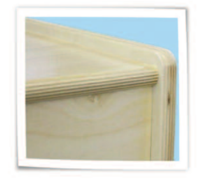
Typical Recessed Plywood Backs