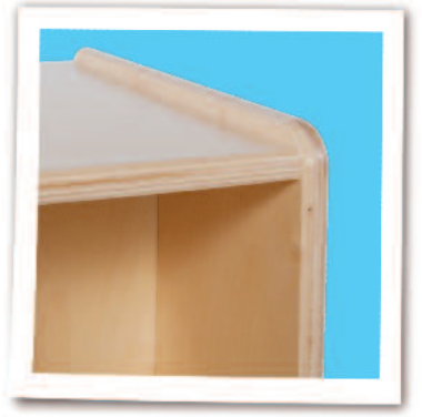
Typical Corners & Edges