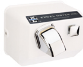
76-W Surface mounted White Epoxy Painted Cover