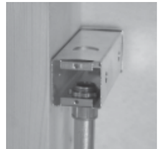
Mini Jbox by LumenArt