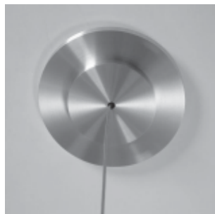
Optional 4" canopy