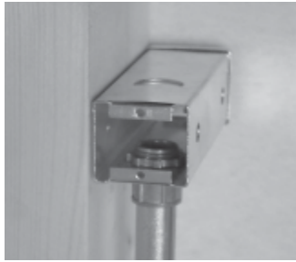
Optional Square Canopy