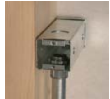
Mini Jbox by LumenArt