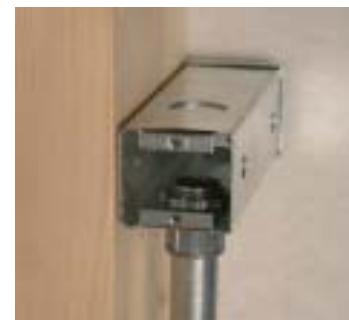
Mini Jbox by LumenArt