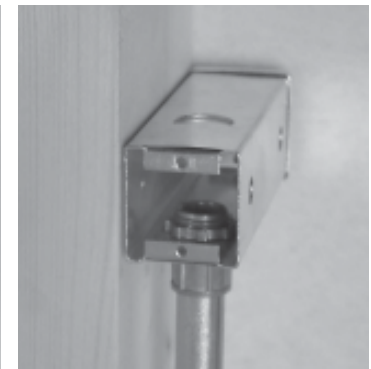
ACL.26 with square backplate Standard Mini JBox