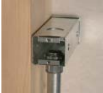
Mini Jbox by LumenArt