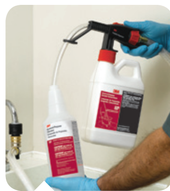
The reusable 3M™ Portable Dispenser with 3M™ Twist 'n Fill™ Technology P10.