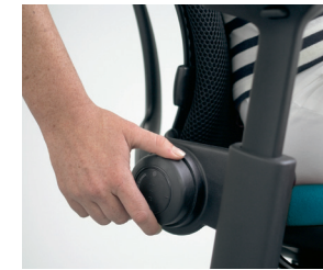
Lower Back Firmness Provides constant support to your lower back.