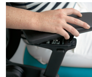
Adjustable Arms Keep your arms, shoulders and neck properly aligned.