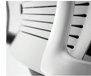
LiveBack® Changes shape to mimic the movement of the spine.

WITH AN EXCEPTIONAL RANGE OF ADJUSTMENTS, LEAP DELIVERS FULL SUPPORT FOR VARIOUS BODY SHAPES AND SIZES.