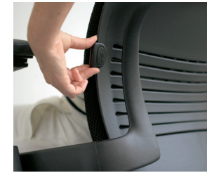
Adjustable Lumbar Fits the curve of your lower back for additional support.