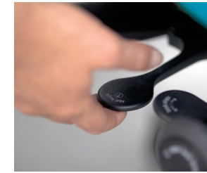
Adjustable Seat Height Adjusts to fit various heights.