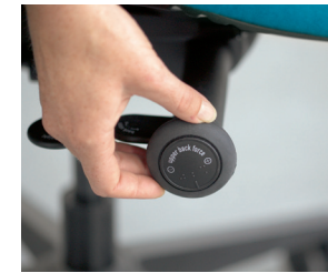
Upper Back Force Controls the precise amount of "push back" as you recline.