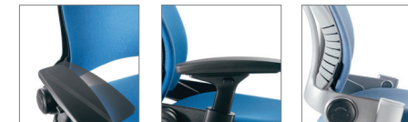
FULLY ADJUSTABLE ARMS

Available with fully adjustable arms, height adjustable arms, and armless.