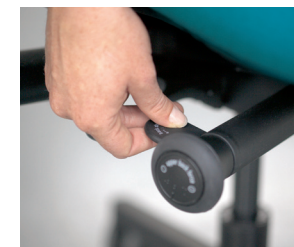
Variable Back Stop Sets the angle of recline to one of five positions.