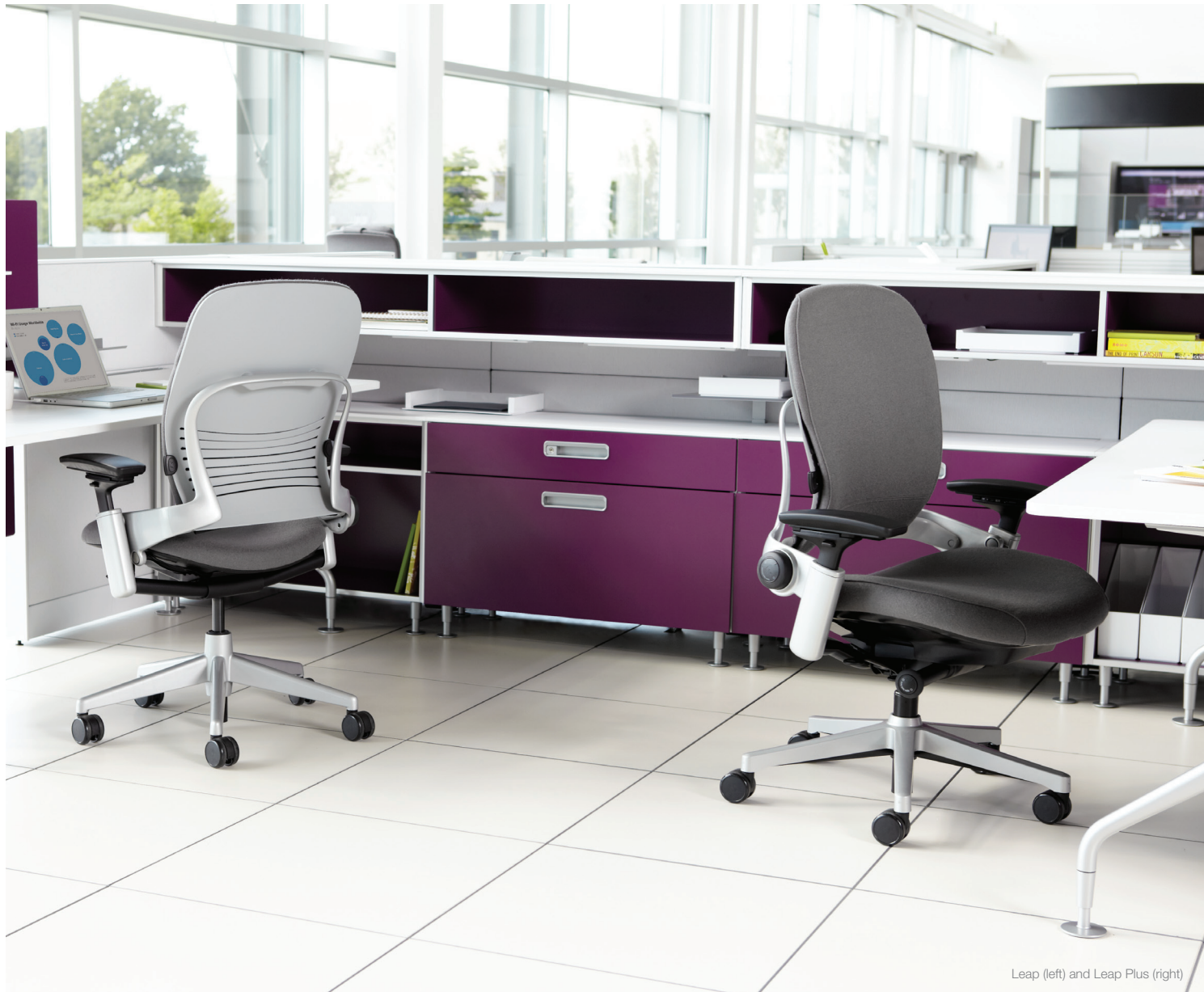
Leap (left) and Leap Plus (right)