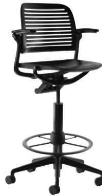
Stool with arms