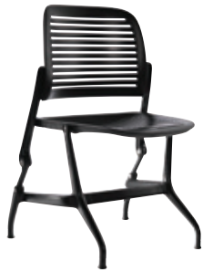
Multi-Use Chair without arms