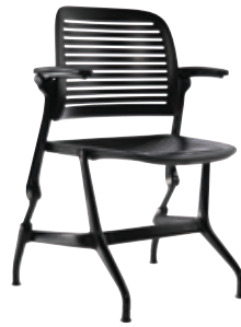
Multi-Use Chair with arms