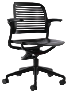
Work Chair with arms