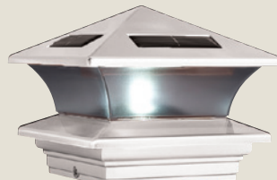
Solar Summit White & Black 5x5