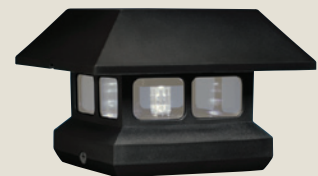
Luminus Solar 4x4