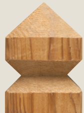
Suburban Pyramid 4x4