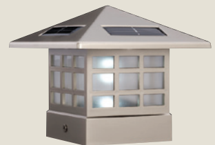
Solar Bungalow Stainless 4x4