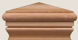
High Pyramid 4x4