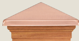
Copper High Point 4x4 / 6x6