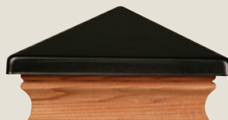
Cascade Summit Black 4x4