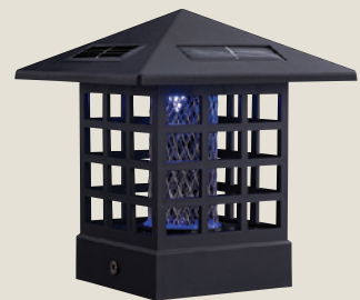
Solar Bug Zapper 4x4