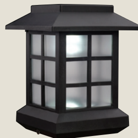
Solar Cottage Black 4x4