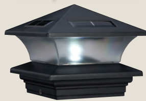
Solar Summit Black & Copper 4x4