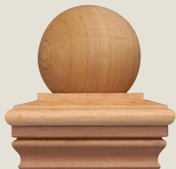
Ball Cap 4x4