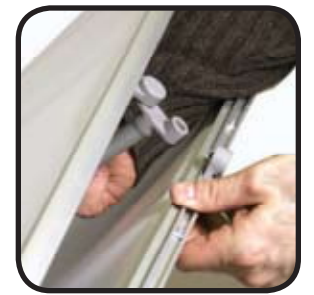
Repeat steps 7 & 8 for the second graphic