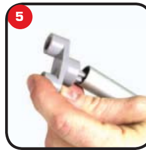
Attach doubler to the top of the pole