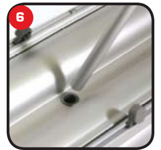
Place pole into the units pole socket.