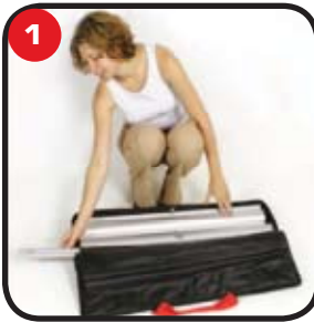
Remove doubler from the velcro pocket and the pole from the pole pocket