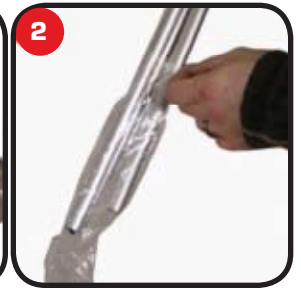
Remove pole from plastic bag