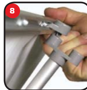
Attach the graphic rail to the doubler