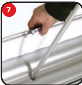
Tilt the unit toward yourself while raising the graphic to the top of the pole