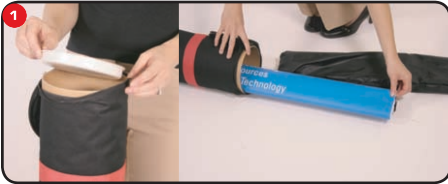
1 Unzip bag and remove cap, then remove graphic and unit from tube.