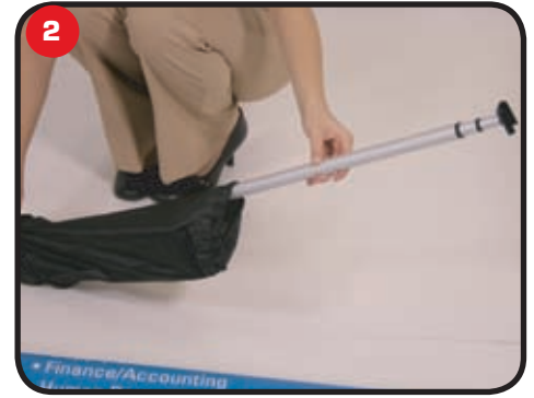
2 Remove unit from black bag.