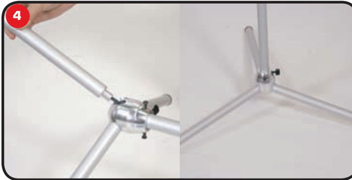
4 Attach legs to the base of unit, then stand unit upright.