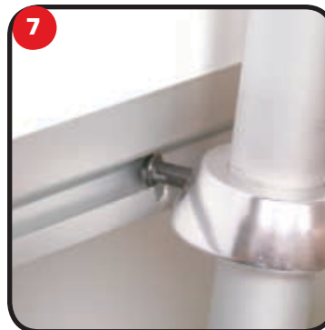
7 Attach bottom graphic rail to bottom rail fitting.