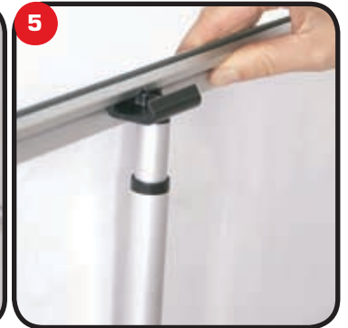
5 Attach top graphic rail to the top of the unit and let the graphic hang down.