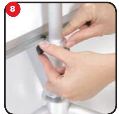
8 Put tension on graphic and tighten screw on bottom rail fitting.