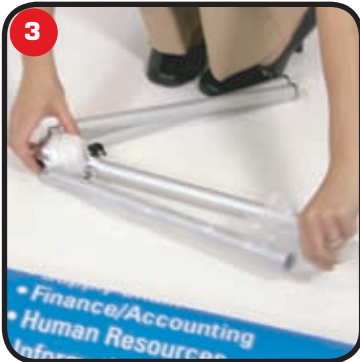
3 Remove plastic bags from legs of the unit and protective covering from the base.