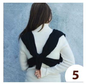
Reach behind your back and slide support band down so that the loops cross at the center of your back (for optimal back support).