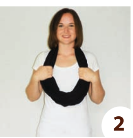
Put both loops over your head like a necklace (with support band at the back of your neck).