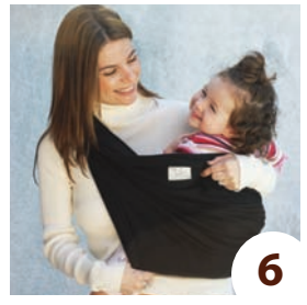
Make sure the fabric covers baby's bottom up to under his/her knees and is spread over his/her back.