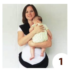
Hold your baby securely against your body facing inward (towards you).

Read and follow Instructions and Warnings (Pg. 16-17) before placing child in Baby Carrier. Sash must be used in Hug Position in order to secure baby properly in carrier. If baby does not yet have head control, adjust either loop to support baby's head.