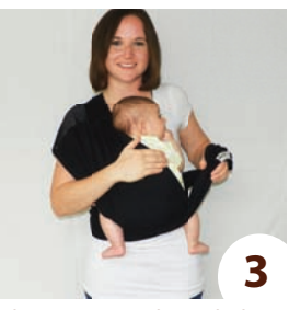
Place your arm through the outer loop (at your waist). Pull it up between baby's legs, over baby's shoulder and onto your shoulder.