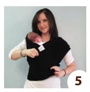
Spread the fabric of the outer loop over baby's back and bottom. Make sure that the fabric does not cover your baby's face.