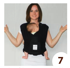
Adjust fabric on your shoulders so that it is comfortable.