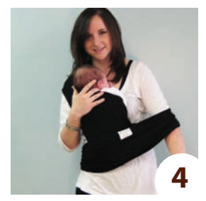
Place your arm through the outer loop that is hanging at your waist, and pull it back up onto your shoulder.