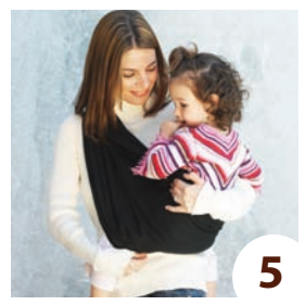
Lift child up and place him/her in the Carrier with legs straddling your hip. Tip: child's shoulders and arms may be free of the fabric.