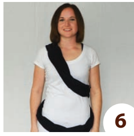
The outer loop will now be hanging at your waist, and the inner loop will still be lying diagonally across your torso.