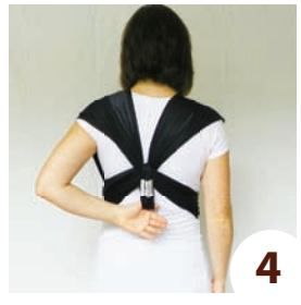
Reach behind your back and slide the support band down so that the loops cross at the center of your back for optimal back support.