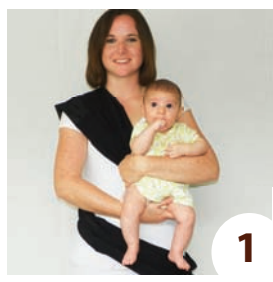
Hold your baby securely against your body facing outward.

Read and follow Instructions and Warnings (Pg. 16-17) before placing child in Baby Carrier. Adventure Position may only be used when baby is able to hold his/her head upright unassisted. Sash must be used in Adventure Position in order to secure baby properly in carrier.