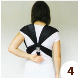
Reach behind your back and slide the support band down so that the loops cross at the center of your back for optimal back support.