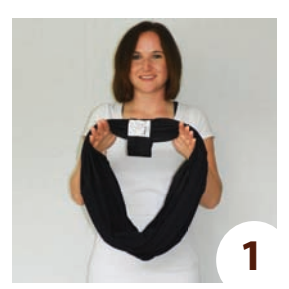
Put both loops together to form a circle.

After placing one arm through each loop, the "X" might fall near your neck; simply take a moment to pull it down so that the "X" falls at the center of your front and back.