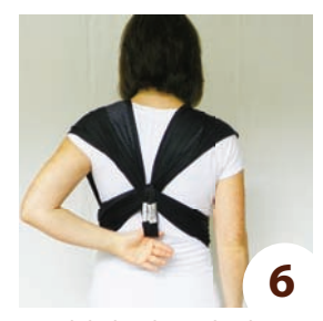
Reach behind your back to slide support band down so that the loops cross at the center of your back (for optimal back support).