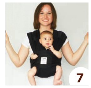
Adjust fabric on your shoulders so that it is comfortable.