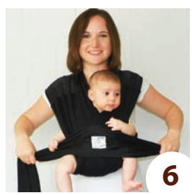
Tie sash tightly around your waist and your baby for extra security and additional back support. Sash must be used.