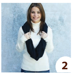
Put both loops over your head like a necklace (with support band at the back of your neck).