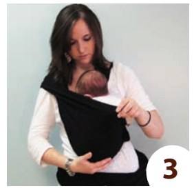
Make sure baby is centered in the fabric with an equal amount of material on front and back of baby's body.