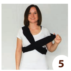
Take the outer loop (the one farthest from your body) and lower it from your shoulder.