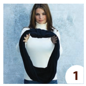
Put both loops together to form a circle.

Read and follow Instructions and Warnings (Pg. 16-17) before placing child in Baby Carrier. Hip Position may only be used when child is able to sit up unassisted. When carrying your child in the Hip Position, keep one arm encircled around your child's back at all times for support and balance.