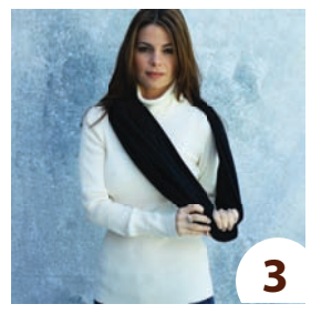
Place one arm through BOTH loops and then layer one loop over the other.