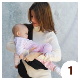
Place baby in an upright sitting position in the center of the inner loop.

Read and follow Instructions and Warnings (Pg. 16-17) before placing child in Baby Carrier. Explore Position may only be used when baby is able to hold his/her head upright unassisted.