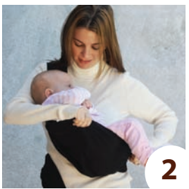
Make sure baby is centered in the fabric (as if sitting up in the center of a hammock). Baby's head, shoulders and one or both arms can be free of the fabric.