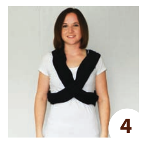
Carrier should now cross ("X") at your front and your back, with support band in the middle of the X at your back.