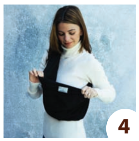
Stretch open the fabric of the carrier at your side so it forms a hammock-like seat.