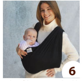
Adjust fabric on your shoulders so that it is comfortable.