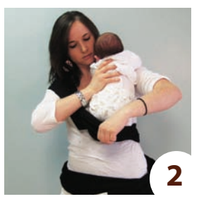
Place baby upright (or in an upright fetal position) in the pocket-like seat of the inner loop.