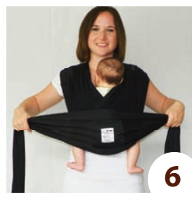
Tie sash tightly around your waist and your baby for extra security and additional back support. Sash must be used.