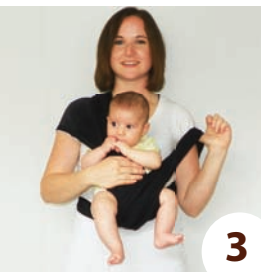
Place your arm through the outer loop (at your waist). Pull it up between baby's legs, over baby's shoulder and onto your shoulder.