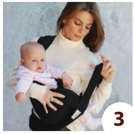
Place your arm through the outer loop that is hanging at your waist, and pull it back up onto your shoulder.