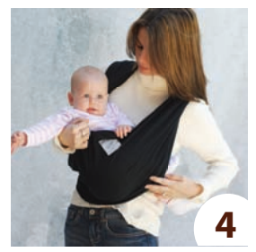
Spread the fabric of the outer loop over baby's bottom.