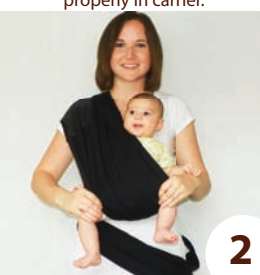
Place the inner loop between your baby's legs and pull it over baby's shoulder. Spread it open to create a comfortable seat for baby.