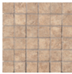
12"x12" - 1091404