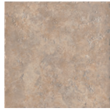
18"x18" - 1090525