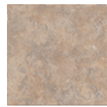
12"x12" - 1092635