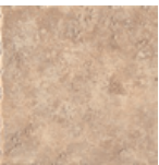
12"x12" - 1092637