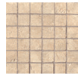
12"x12" - 1091398