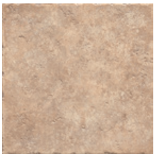
18"x18" - 1090543