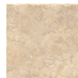
12"x12" - 1092623