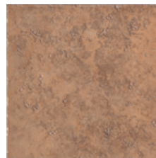
18"x18" - 1090548