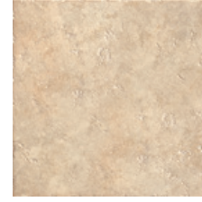
18"x18" - 1090538