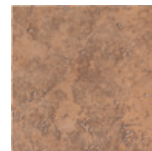
12"x12" - 1092638