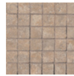
12"x12" - 1091387