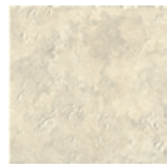
12"x12" - 1092636