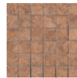
12"x12" - 1091410