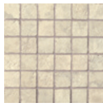
12"x12" - 1091392