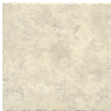
18"x18" - 1090532