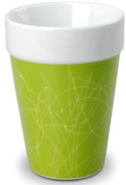
Art no. 567094 Green 375C