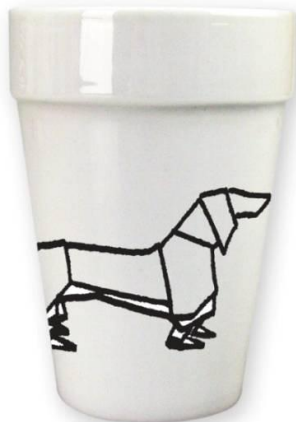
Art no. 567248 (DOG)