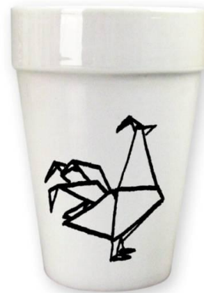
Art no. 567247 (ROOSTER)