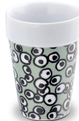
Art no. 567134 Grey 414C