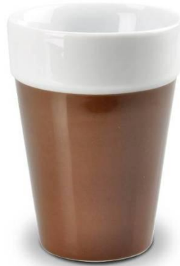
Art no. 567137 Brown 7518C