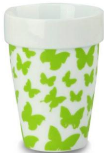
Art no. 567208 Green 375C