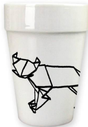
Art no. 567244 (TIGER)