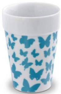
Art no. 567119 Turquoise 312C