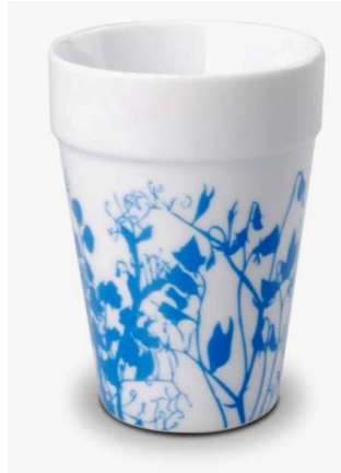
Art no. 567064 Turquoise 312C