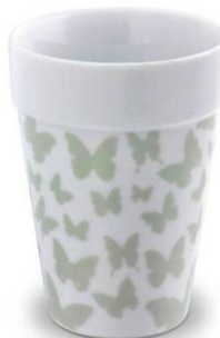
Art no. 567129 Grey 414C