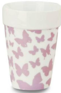
Art no. 567207 Purple 2645C