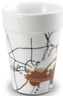
Art no. 567125 Brown 7518C