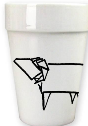
Art no. 567250 (RAM)