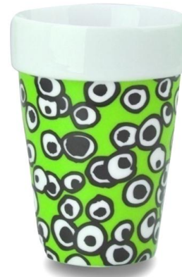
Art no. 567205 Green 375C