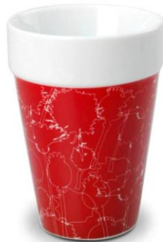
Art no. 567089 Red 200C