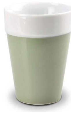
Art no. 567141 Grey 414C