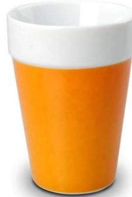
Art no. 567038 1375C