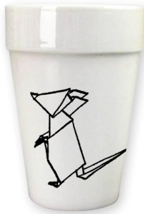
Art no. 567249 (RAT)