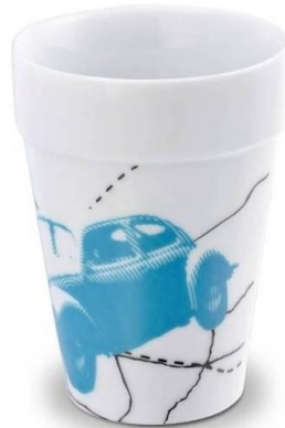
Art no. 567123 Turquoise 312C