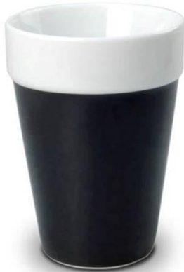
Art no. 567039 Black