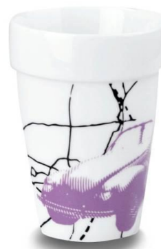
Art no. 567210 Purple 2645C