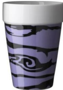
Art no. 567254 Purple 2645C