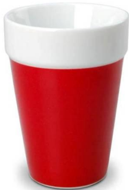
Art no. 567048 Red (200C)