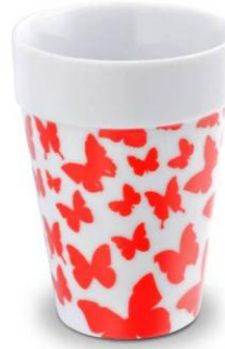
Art no. 567117 Red 200C