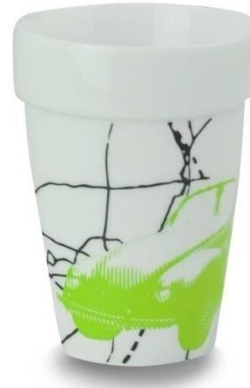
Art no. 567211 Green 375C