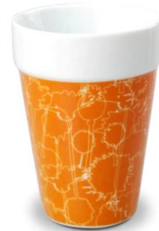
Art no. 567090 Orange 021C