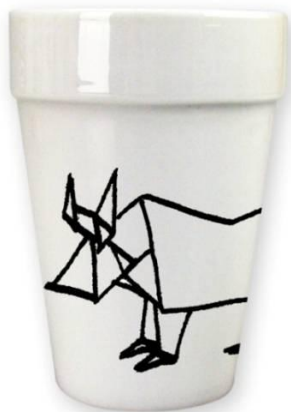
Art no. 567239 (OX)