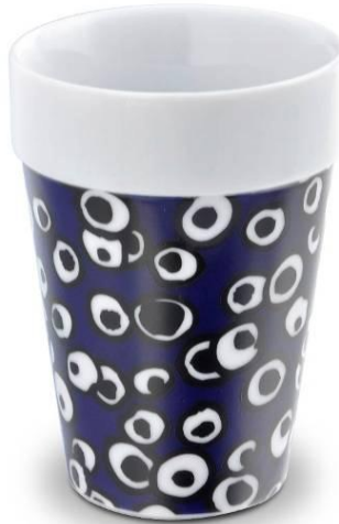
Art no. 567131 Navy 541C