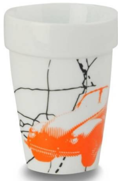
Art no. 567209 Orange 012C