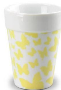
Art no. 567128 Yellow C