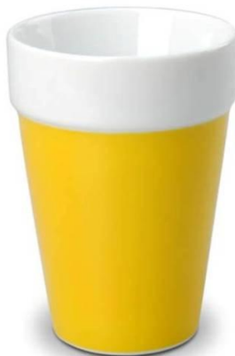
Art no. 567045 yellow C