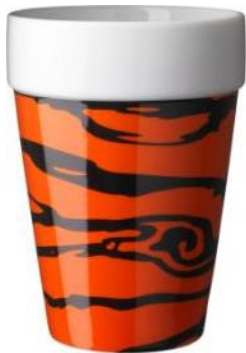
Art no. 567253 Orange 021C