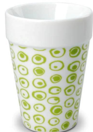
Art no. 567059 Green 375C