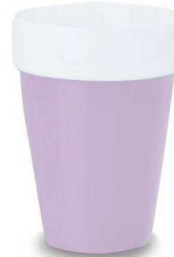
Art no. 567201 Purple 2645C