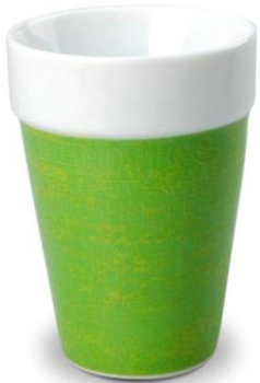
Art no. 567087 Green 375C