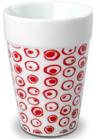
Art no. 567057 Red 200C