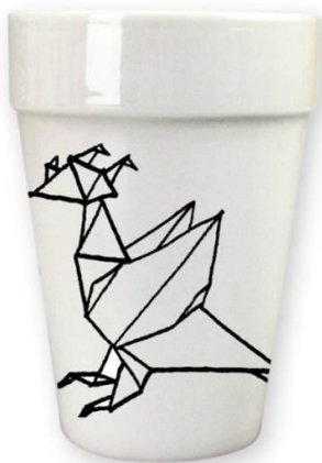
Art no. 567245 (DRAGON)