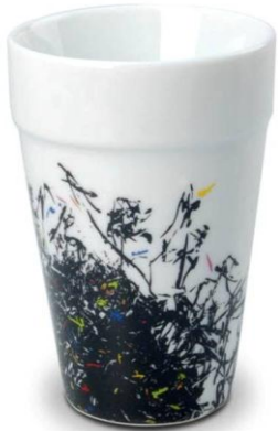
Art no. 567079 Black