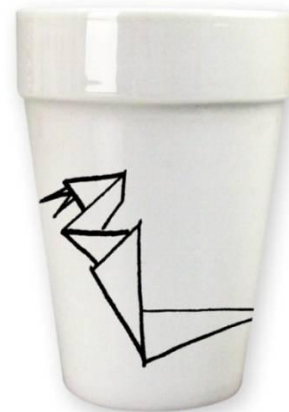
Art no. 567241 (SNAKE)