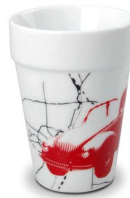
Art no. 567076 Red 200C