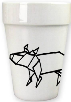
Art no. 567246 (PIG)