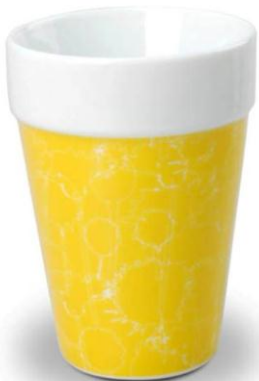
Art no. 567091 Yellow C