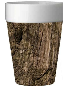
Art no. 567251 Wood texture