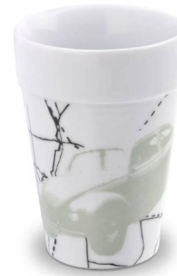
Art no. 567122 Grey 414C