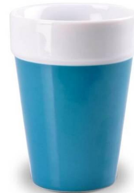
Art no. 567139 Turquoise 312C