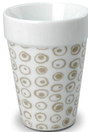
Art no. 567055 Grey 414C