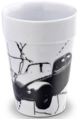
Art no. 567121 Black