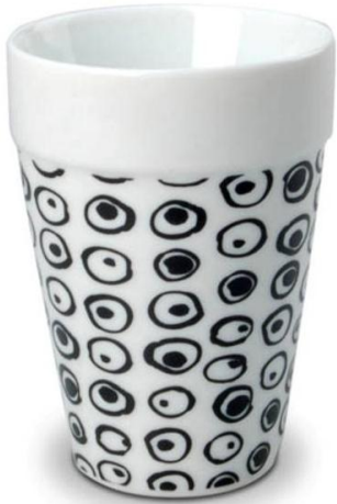
Art no. 567050 Black