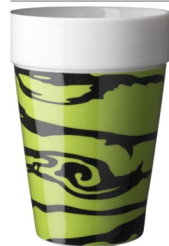
Art no. 567255 Green 375C