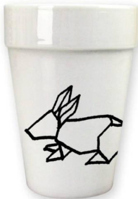
Art no. 567240 (HARE)