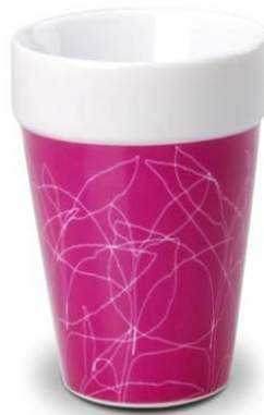
Art no. 567099 Purple