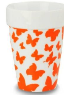
Art no. 567206 Orange 021C