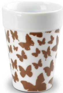
Art no. 567118 Brown 7518C