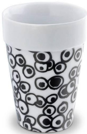
Art no. 567132 Black