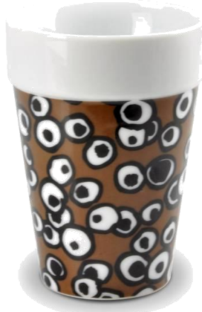
Art no. 567136 Brown 7518C