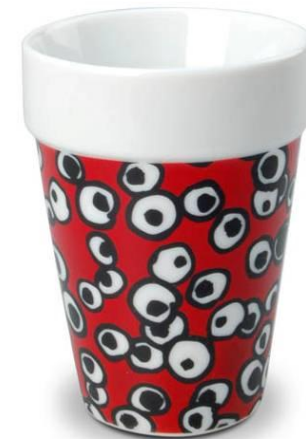
Art no. 567051 Red 200C