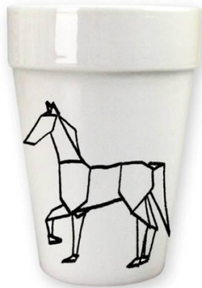
Art no. 567242 (HORSE)