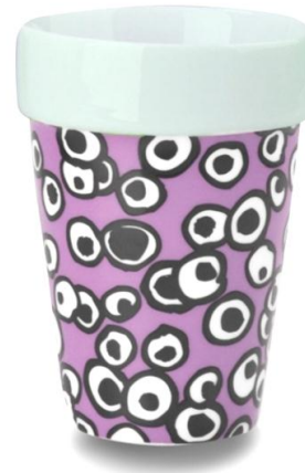
Art no. 567204 Purple 2645C