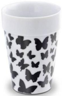
Art no. 567127 Black