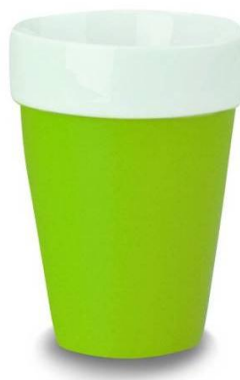
Art no. 567202 Green 375C