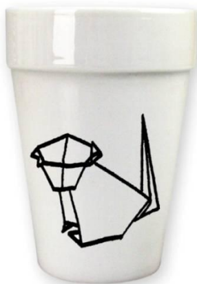
Art no. 567243 (MONKEY)