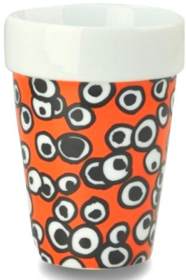
Art no. 567203 Orange 021C