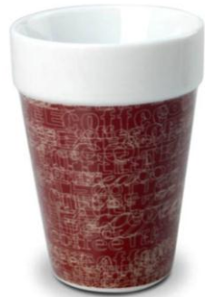
Art no. 567088 Brown 7518C