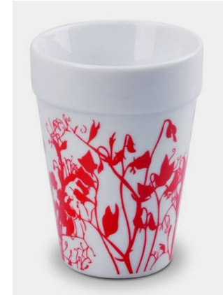
Art no. 567101 Red 200C