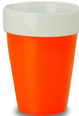
Art. No. 567200 Orange 021C