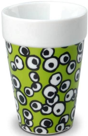
Art no. 567052 Green 375C