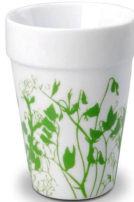
Art no. 567065 Green 375C