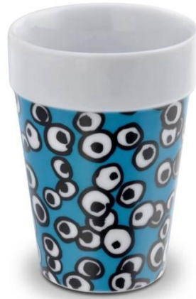
Art no. 567133 Turquoise 312C