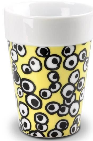
Art no. 567135 Yellow C