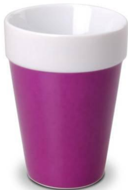
Art no. 567100 Purple 7662C