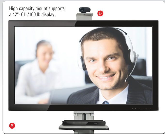
High capacity mount supports a 42"-61"/100 lb display.