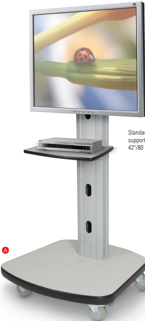
Standard mount supports up to a 42"/80 lb display.